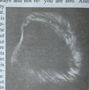
Mystery cloud as seen in Life Magazine, May 12, 1963